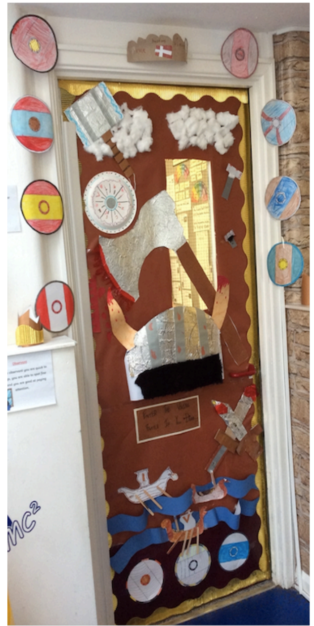
The Viking Boy