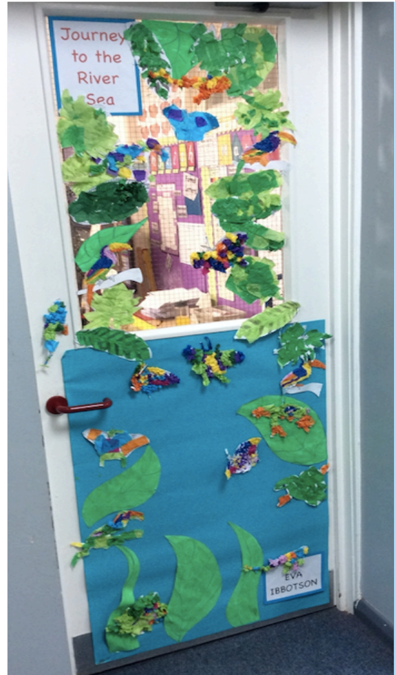
Journey to the River Sea