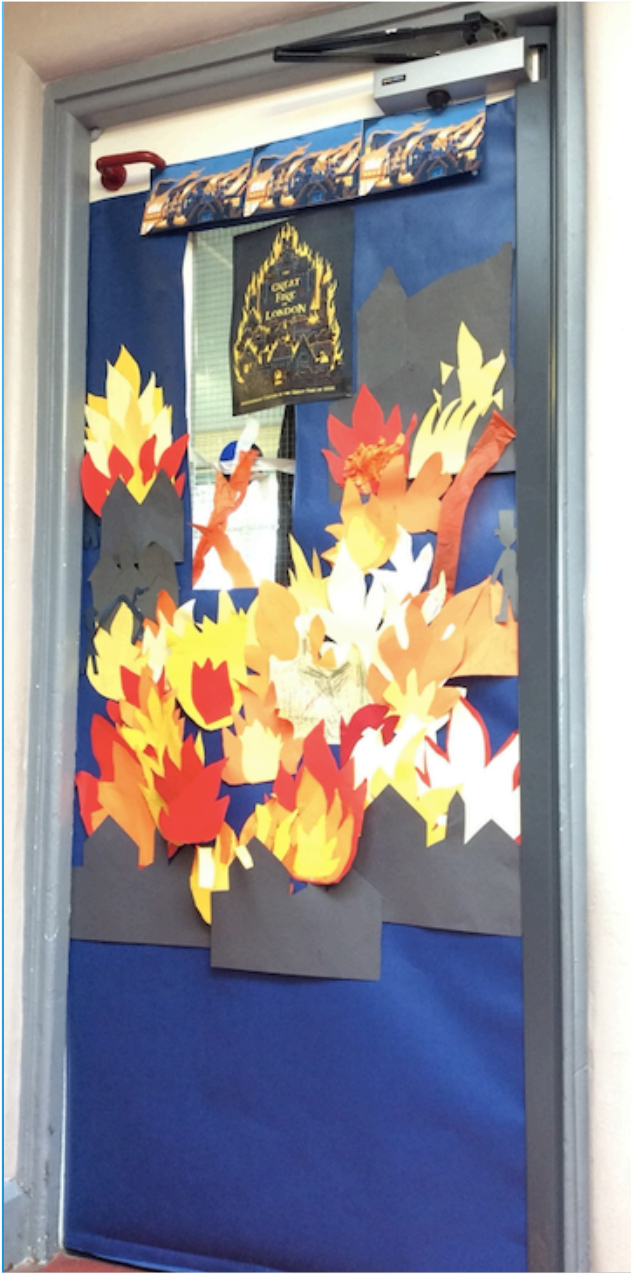
The Great Fire of London