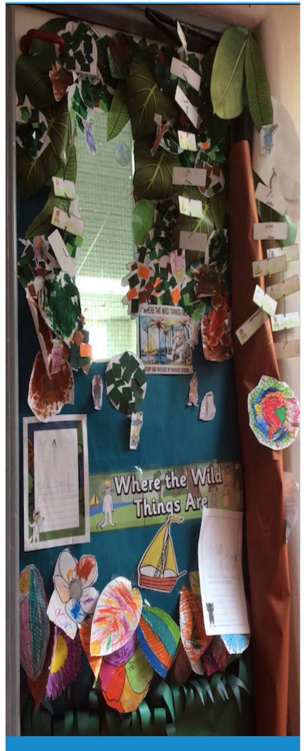
Where the Wild Things Are