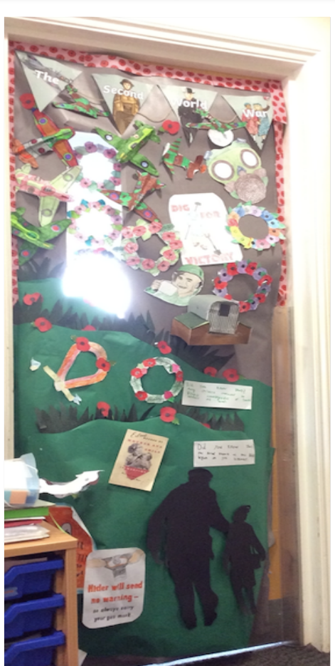
Goodnight Mr Tom