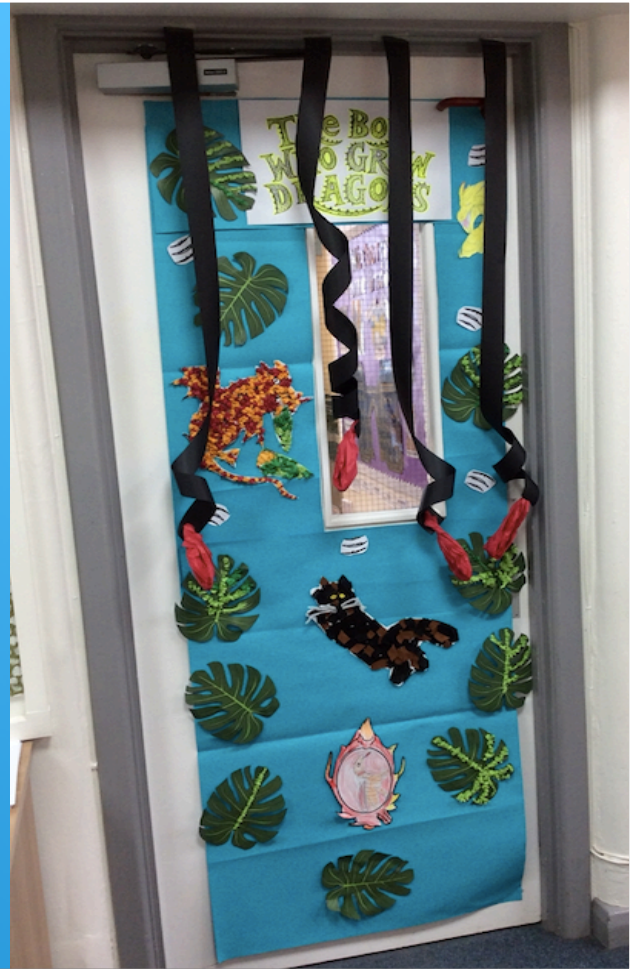
The Boy Who Grew Dragons