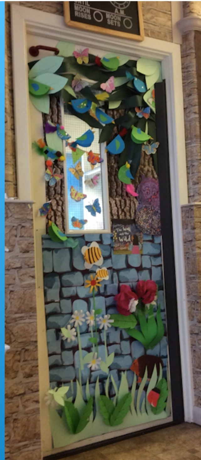
The Wall and the Wild