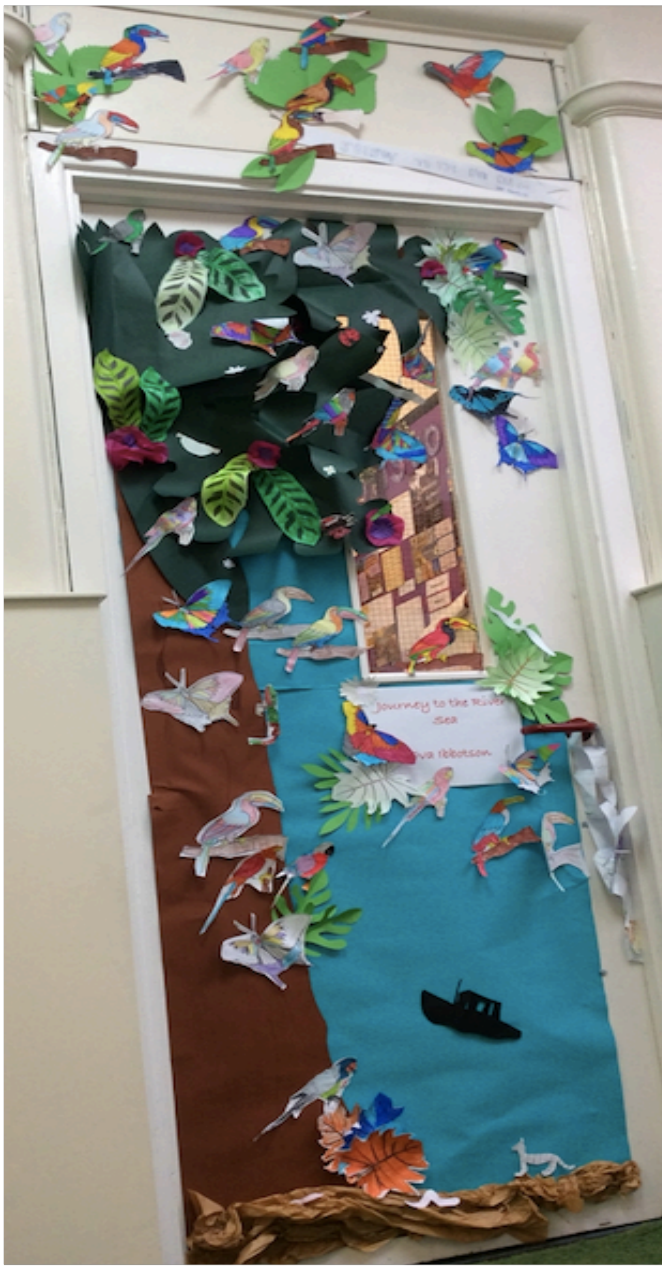
Journey to the River Sea