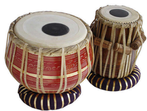
Tabla - drums hold the rhythmic line