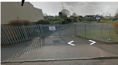
Front of School