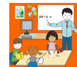
A l'école At school