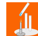
Les sciences Science