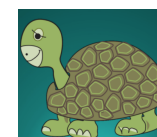
une tortue a tortoise