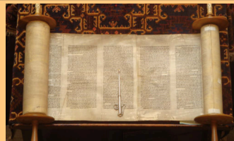
This is part of the Hebrew Bible - a very, very long page that has been rolled up.